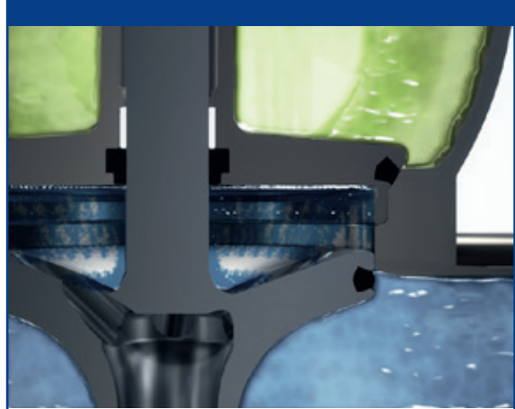
Seat push: The lower plug is pushed downwards thus cleaning the plug seal, seat and leakage chamber through CIP flow.