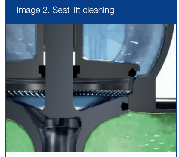
Seat lift: The upper valve plug is raised off the seat thus cleaning plug seal, seat and leakage chamber through CIP flow.

Alfa Laval Unique Mixproof SeatClean is the choice for standard installations that handle products with solids. Seat lift during normal cleaning procedures cleans the plugs and seats.